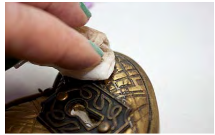
Illustration 9: step 10

10. Brush a portion of the heart with the dark grey or black acrylic paint and immediately wipe the upper surface with a damp paper towel. This should leave the paint in the depths of the stamped pattern.