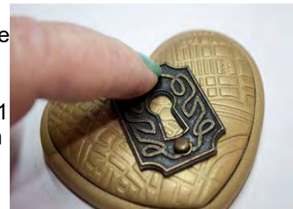
Illustration 6: step 6

or 2 small brads at the of the extruded clay and large eye pin into the the top.