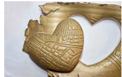
Illustration 4: step 4a