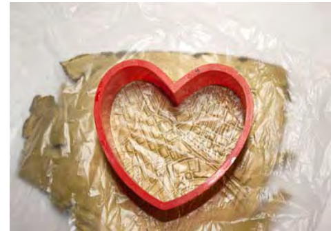
Illustration 3: step 3