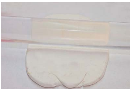
Illustration 2: step 2