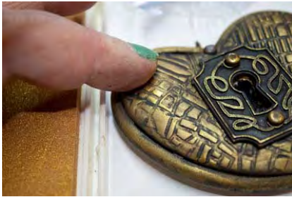
Illustration 10: step 11

11. If you wish, you can brush some golden highlights lightly onto the clay using either a metallic pigment ink stamp pad or gold acrylic paint applied with a dry brush.