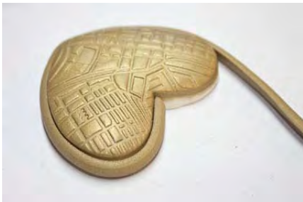
Illustration 5: step 5

and extrude a length about 12 inches long. Wrap this around the edge of the heart to "finish it", starting at the top center of the heart. (You can also paint the edge of the heart and skip the extruded clay!)