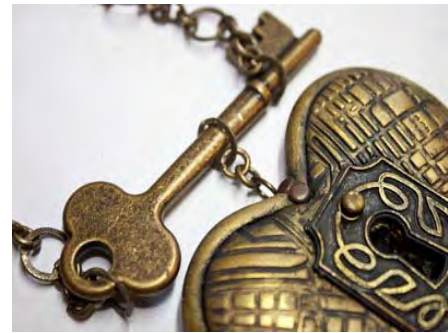
Illustration 11: step 12

12. Attach the heart to the center of the key, using as many links as necessary to suspend the heart above the key. Attached the neck chain to the key on either side and add your closure. (I've used an antique style pin).